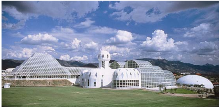
The Columbia University Biosphere 2, located outside of Tucson, Arizona, selected Earth Savers to update its lighting systems with the latest energy saving technology.

Earth Savers has performed over 500 energy efficiency upgrade projects all over the United States from New York to Hawaii. Five of the top ten health care companies have chosen Earth Savers as their source of energy efficient lighting products and services. Earth Savers is known for its practical and simple approach to saving money for its customers. Earth Savers teams with manufacturers of the best equipment available to create the finest quality installations with the best results attainable.